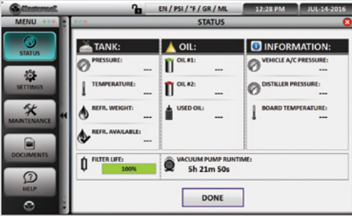
Status Screen for quick reference of resources