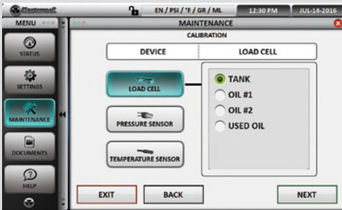
Maintenance Screen offered only to authorized service technicians allowing for quick and easy diagnosis