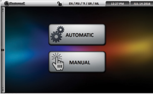
Home Screen allows for quick touch selection of options